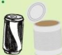
Cans and Tins